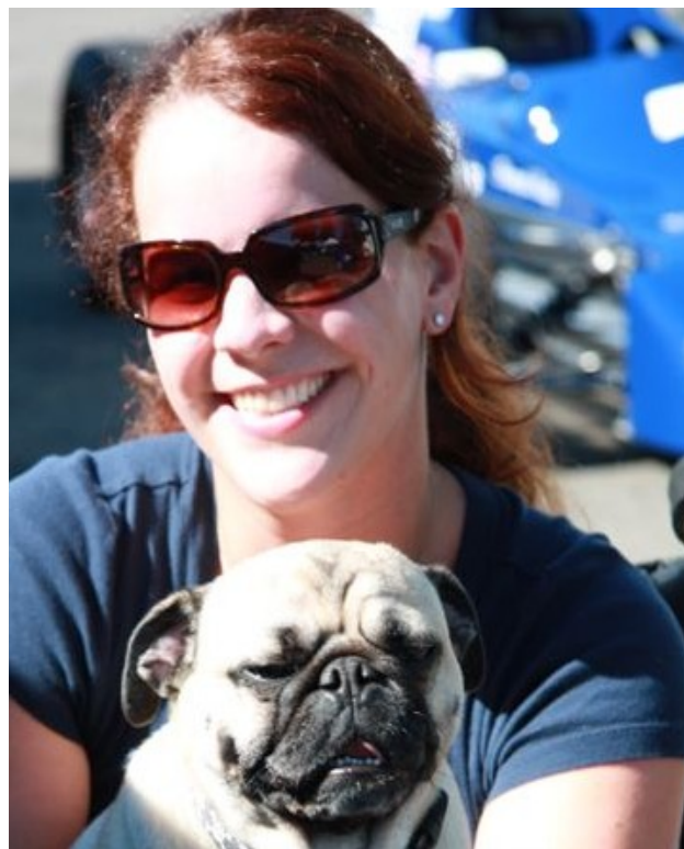
Gorgeous Girl with Priceless Pug

From there, follow directions for ordering online or contact Gerry or Sue for further info, at 604-734-4721 or gerryf@telus.net .